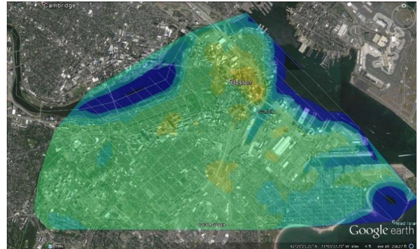
Radiation Exposure Contour Map