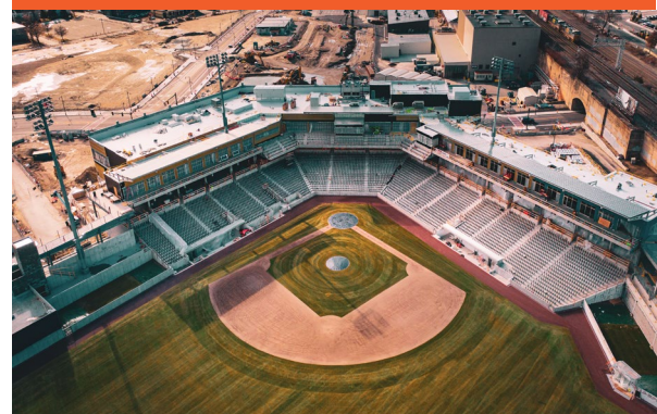
Aerial View of Polar Park.

Former Uses: Parking Lot, Manufacturing Facility