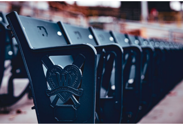
Polar Park's seats are symbolic of Worcester's location at the heart of the Commonwealth.

“Polar Park has been a shining example of what the Brownfields Program seeks to accomplish. The public investment in the ballpark has leveraged substantial private investment and has significantly generated both environmental benefits as well as economic benefits. The project has also added a new opportunity for family fun entertainment, contributing to the city of Worcester's quality of life as a destination to live, work and play.”