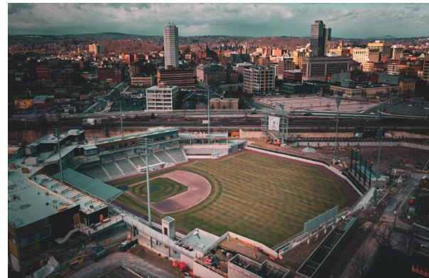
Aerial View of Polar Park.

The project, led by the Worcester Redevelopment Authority, in partnership with the City of Worcester, the Commonwealth of MA including the Massachusetts Department of Environmental Protection, the Worcester Red Sox (then Pawtucket Red Sox), EPA, and the private development firm worked together on the overall vision of the area. Thorough study of site conditions revealed that contaminated soils were present throughout the property and would need significant work to manage and clean up. With the help of a $2 million grant from Mass Development's Brownfields Redevelopment Fund, $7,300 from an EPA Brownfields Assessment grant, and $500,000 subgrant from an EPA Brownfields Revolving Loan Fund, over 150,000 tons of soil were excavated, managed, and taken off site.