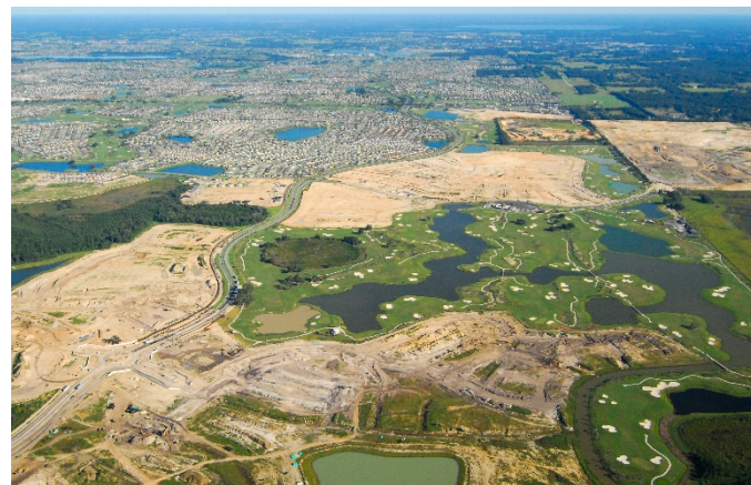
Aerial view of a subdivision construction project with sections completed in stages. Some areas are permanently stabilized while other areas are disturbed.

Construction staff should sequence construction projects to reduce the amount and duration of bare soil exposure while maintaining compatibility with the general