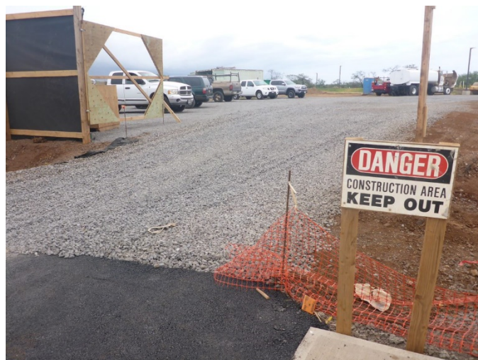
A construction entrance stabilized with gravel over filter cloth reduces the amount of sediment transported off site.

Construction staff should install track-out controls anywhere construction traffic leaves or enters a construction site. Track-out controls can also provide benefits from a public relations point of view, as the site entrance/exit is often the most noticeable part of a construction site and can show community members that controls are in place to minimize sediment being tracked onto nearby streets and neighboring areas. Minimizing sediment on roads can improve both the appearance and the public perception of the construction project as