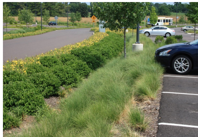
Infiltration trenches at Einstein Hospital in East Norriton.

Design engineers need to site infiltration trenches carefully. They should ensure that the soils on-site are appropriate for infiltration and that there is minimal