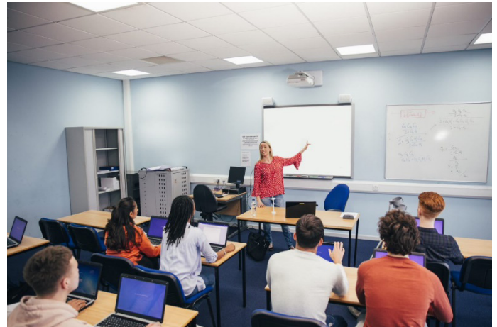
Routine stormwater training for all municipal employees and contractors is a crucial component of operating a successful stormwater program.

Municipal training and education can take many forms and cover a wide range of content. It is important for municipal staff to design a training and education program around the specific needs of their municipality.