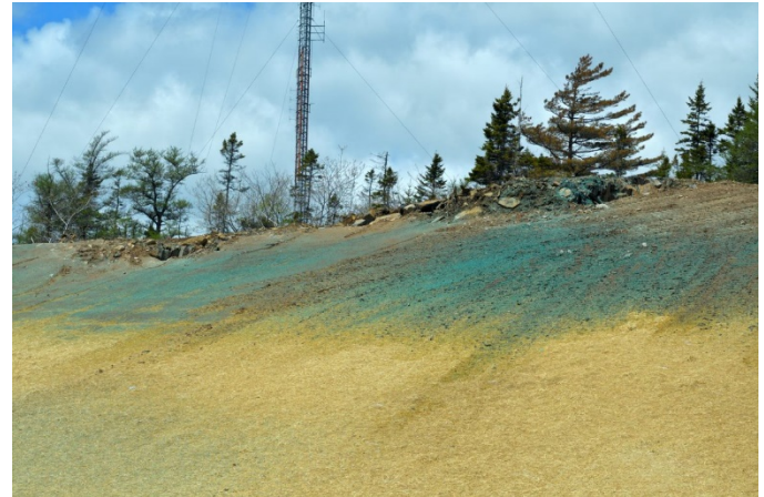
Hay and hydroseed can be used on a slope to establish vegetative cover.

Before seeding, construction staff should prepare and amend the soil on a disturbed site to provide sufficient nutrients for seed germination and seedling growth. This includes loosening the soil surface to allow for water