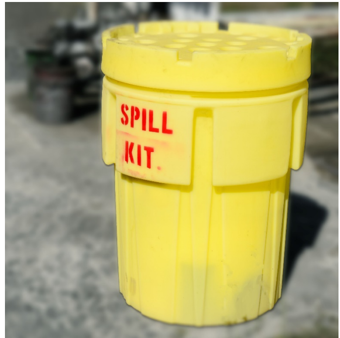
Skill kit at a construction site.

Spill prevention and control measures apply to construction sites that store or use materials such as pesticides, paints, cleaners, petroleum products, fertilizers, concrete wash, metals, solvents, soil stabilizers and binders, and contaminated groundwater. Construction staff should develop spill prevention and control measures for material storage areas, refueling stations (both mobile and stationary), material transfer locations, storm drain inlet and outlet locations, and waterways (WES, 2008). The spill prevention, control and countermeasure (SPCC) rule (40 CFR §112) covers every site with a total aboveground oil storage capacity greater than 1,320 gallons or a buried oil storage capacity greater than 42,000 gallons of petroleum