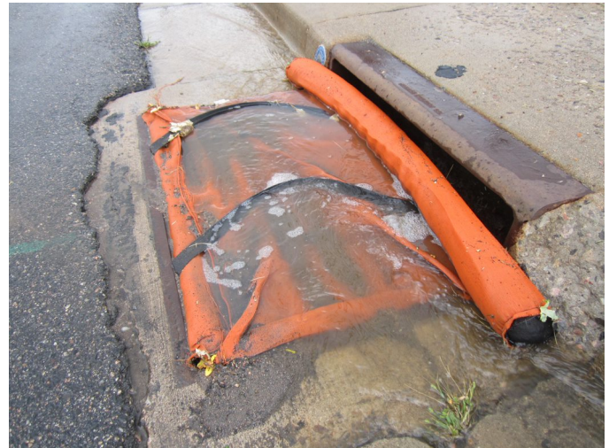
Storm drains and curb inlets should be protected with filter fabric and filter socks, which trap sediment and allow water to flow through.

Internal controls are applicable to areas with high construction traffic or where roadway flooding is a concern (WSDOT, 2019). External controls—which