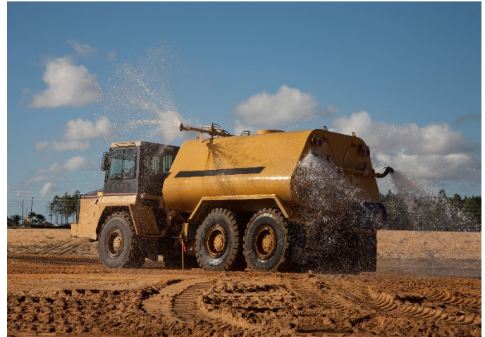
A truck equipped to spray chemical stabilizers throughout a construction site can be more effective at suppressing dust than water alone.

A number of treatment chemicals are available for reducing stormwater-based sediment export from construction sites, including polyacrylamide (PAM—a generic term for a broad class of compounds), chitosan, gypsum, alum (aluminum sulfate), and DADMAC (diallyldimethylammonium chloride). Stormwater treatment chemicals are predominately water-soluble and, depending on their structure, may carry an electric