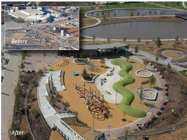
Scissortail Park in Oklahoma City before (inset) and after Section 128(a) funded cleanup oversight and redevelopment.

By providing funds and technical assistance to assess, cleanup, and plan for site reuse, EPA enables communities to overcome the environmental, legal, and fiscal challenges associated with brownfields properties. EPA's investments in communities across the country help local leaders eliminate uncertainties, clean up contaminated properties, and transform brownfield sites into community assets.