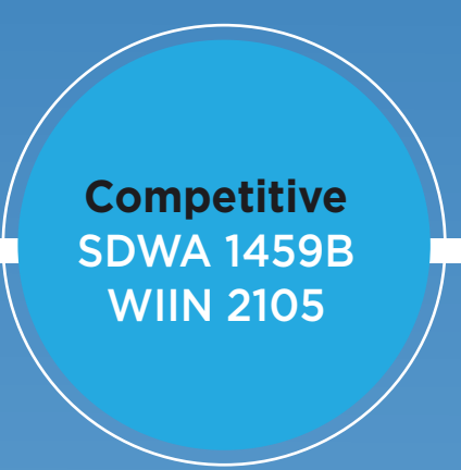
Competitive SDWA 1459B WIIN 2105