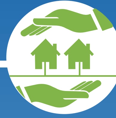
Small, Underserved, and Disadvantaged Communities (SUDC)