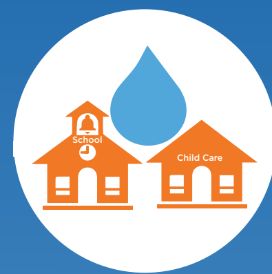
Lead Testing in School and Child Care Program Drinking Water

The WIIN Act addresses, supports, and improves America's drinking water infrastructure. The three grants were established to promote public and environmental health by providing investment in the nation's small and disadvantaged communities, their public water systems, and schools and child care facilities to address lead exposure in drinking water, other contaminants, and compliance issues.