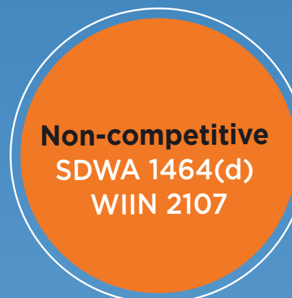
Non-competitive SDWA 1464(d) WIIN 2107