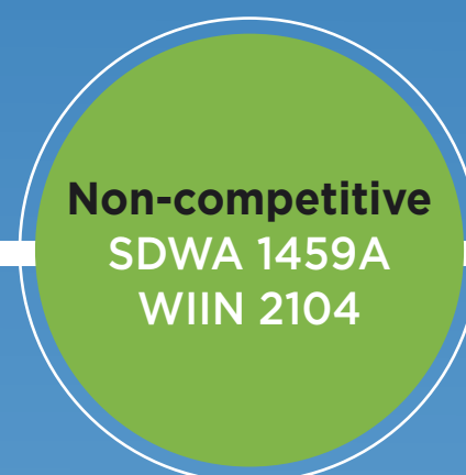
Non-competitive SDWA 1459A WIIN 2104