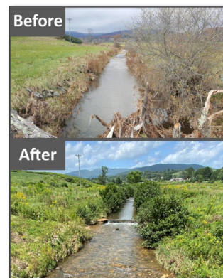
Figure 2. A segment of Naked Creek before and after the stream restoration.

bacteria in the water by filtering all surface runoff, increasing infiltration, and shading the stream to decrease water temperature, which also increased dissolved oxygen. The value of restoring a creek, floodplain, and surrounding habitat on permanently protected land will only improve over time as the planted vegetation becomes more established.