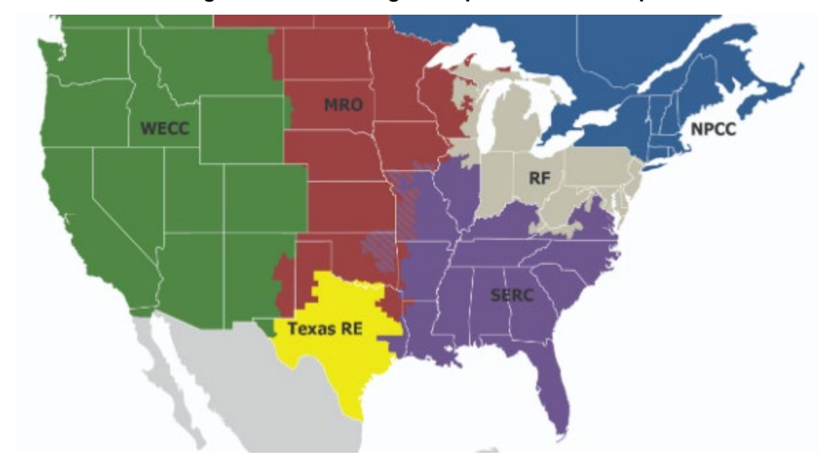
Figure B-2. NERC Region Representational Map