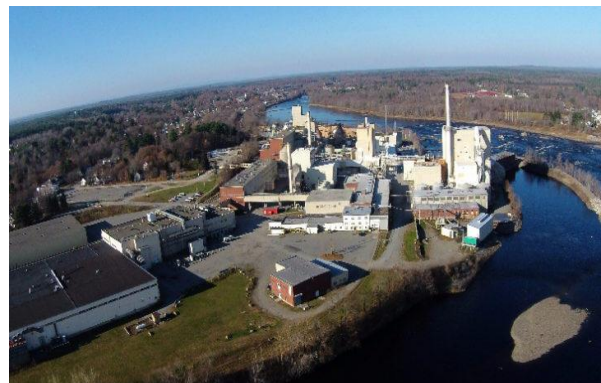
Figure 1: Old Town Paper Mill, Old Town, ME

The City of Old Town, through its Brownfields assessment grant from EPA, performed a detailed investigation to determine the extent of contamination and what cleanup activities were needed. With help from local, state and federal grants, the city developed environmental, brownfield, monetary, and marketing campaigns, which attracted a buyer. This information was vital in marketing the site to potential buyers, and Old Town Paper Mill has used this information as a key factor in its due diligence and purchase decision before redeveloping it.