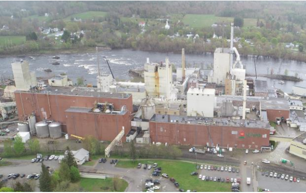
Figure 2. Old Town Paper Mill, Old Town, ME