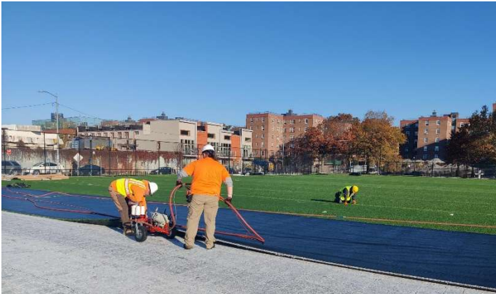
Contractors installing artificial turf on Ball Fields 5 - 8

Contractors placed brightly colored plastic fencing as a visual barrier, labeled in the graphic below as a demarcation layer, over the deeper contaminated soil. This visual barrier was covered with at least one foot of clean soil or other material. NYC Parks then installed artificial turf over all of the ball fields. This barrier system permanently reduces the chance of people coming into contact with contaminated soil on these fields, and will be inspected routinely. A bioswale (planted areas along the fields that collect stormwater that runs off the fields when it rains), new trees, and other improvements were also added.