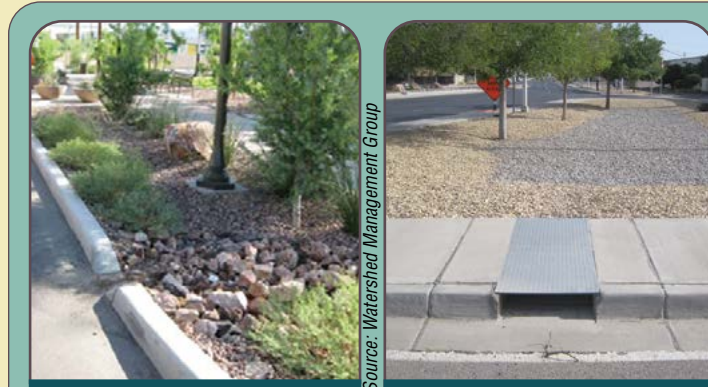
Where vertical curbs are needed curb openings or cuts can be implemented to allow runoff to flow into bioretention systems

Additional examples of bioretention in the ROW: