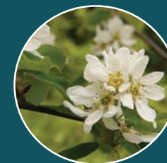
Alder-leaved serviceberry Amelanchier alnifolia 'Regent'