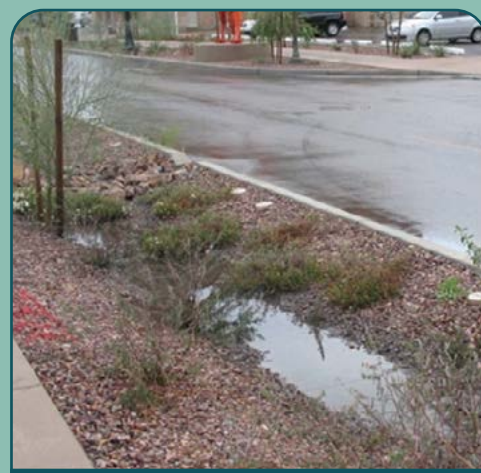
Shallow bioretention in a verge using flat curb. Runoff from the street flows directly into the bioretention area.