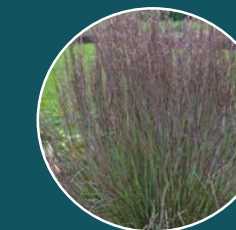
Schizachyrium scoparium Smoke Signal