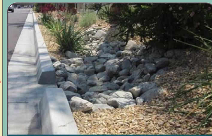
In arid areas stone may be used as surface cover in lieu of mulch