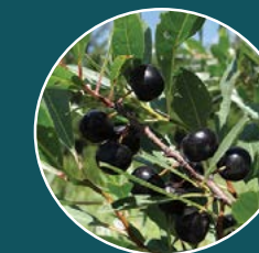
Sand cherry Prunus besseyi 'Pawnee Buttes'