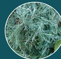
Rocky Mountain juniper Juniperus scopulorum