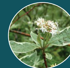
Tatarian dogwood Cornus alba 'Argenteo-marginata'