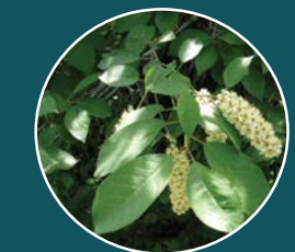
Prunus virginiana Choke Cherry