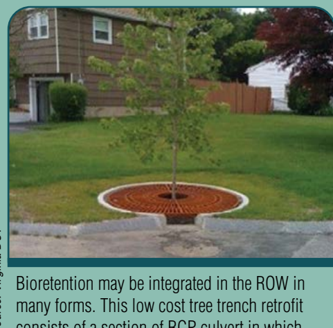
Bioretention may be integrated in the ROW in many forms. This low cost tree trench retrofit consists of a section of RCP culvert in which a streetside tree is planted in a soil media. Roadway runoff is routed into the tree trench where it infiltrates to provide water to the tree.