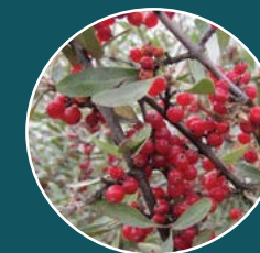
Silver buffaloberry Shepherdia argentea