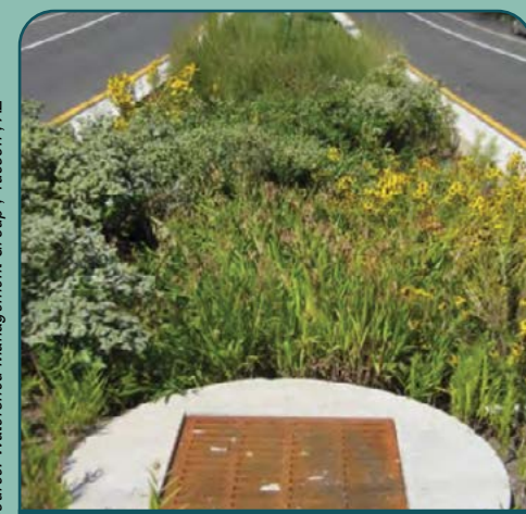
Bioretention placed within a vegetated median on a highway. This configuration requires that a portion of the roadway be sloped toward a depressed median.