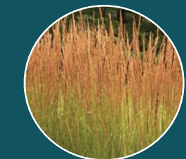
Calamagrostis acutiflora Karl Foerster

Source: Ada County Highway District, Garden City, ID.