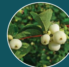
Snowberry Symphoricarpos albus