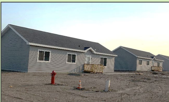
Above: Brand new homes at LaBelle Cour.