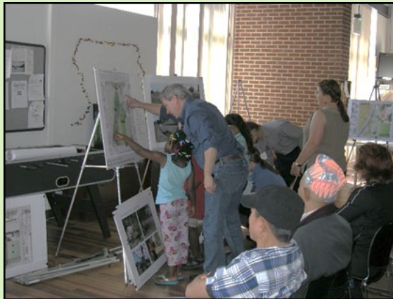
Above: Getting neighbors' input for a stream design in Denver, CO.

Pictured below land revitalization technical assistance in action: