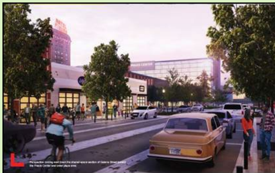
Above: Design concept for a "shared street" in Uptown Butte, MT.