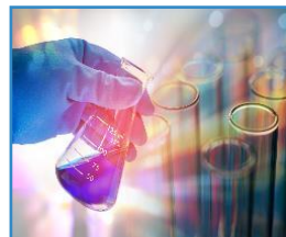
Contaminants of Immediate and Emerging Concern