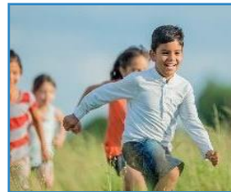
Children’s Environmental Health