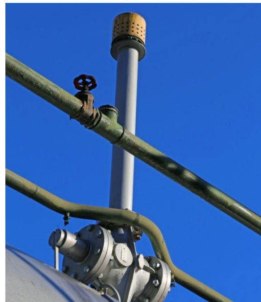
Example of a process vent with valve at the bottom.