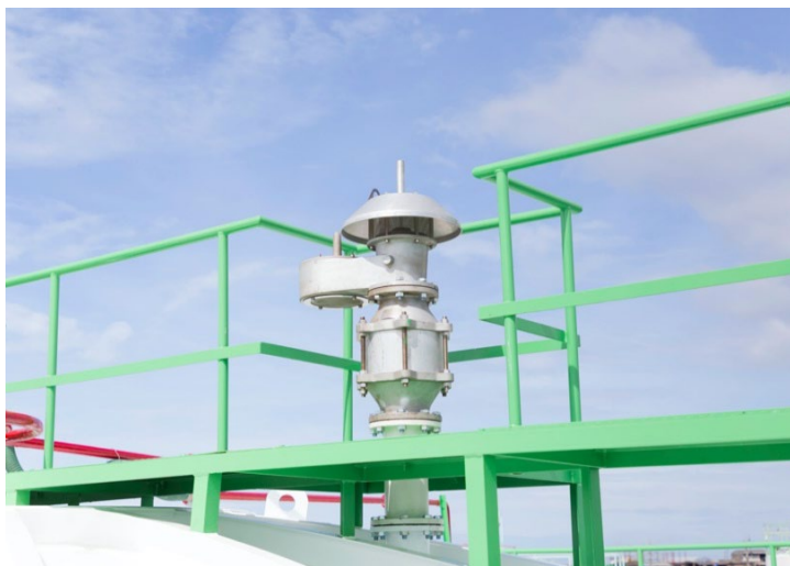
Example of a pressure relief valve located on a tank.