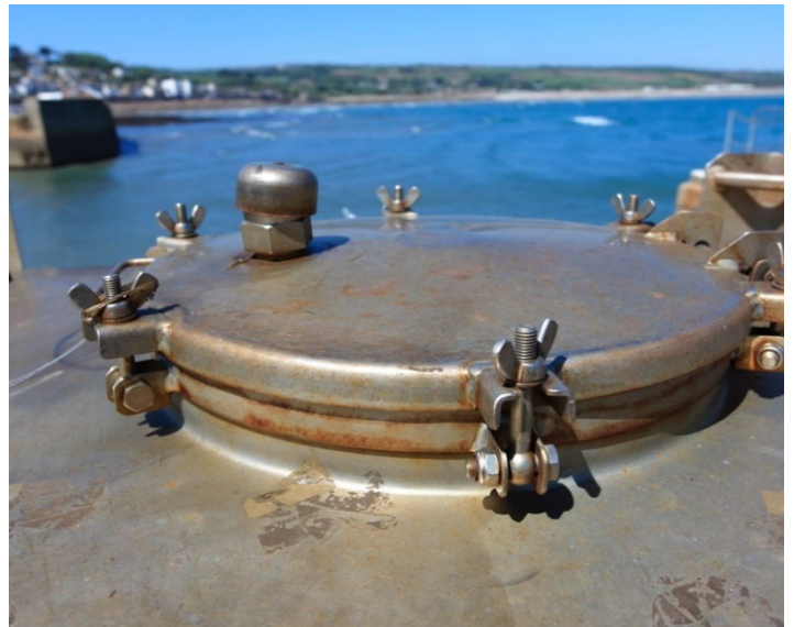
Example of a stainless-steel fuel tank with closure device secured in the closed position so that emissions are controlled.

regulation codified under 40 CFR part 60 , part 61 , or part 63 ." 10