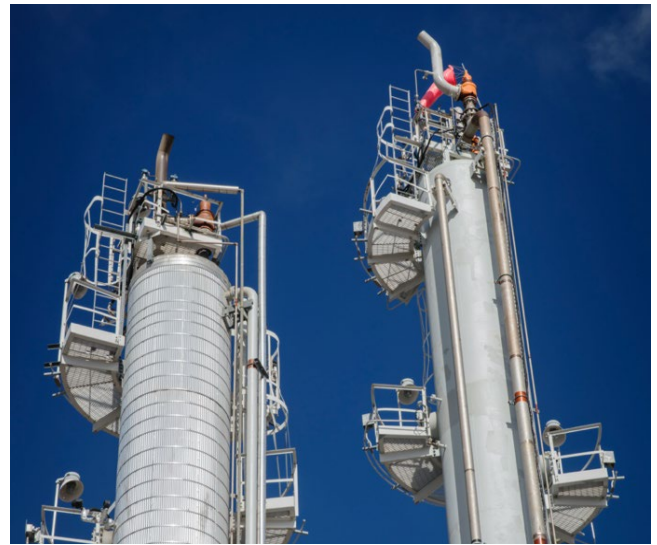
Example of a chemical plant distillation tower. Certain process vents associated with distillation and other processes that manage hazardous waste may be subject to Subpart AA.