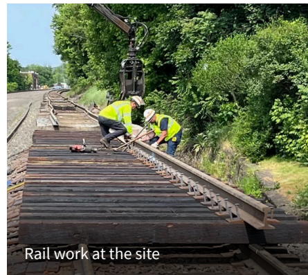
Rail work at the site