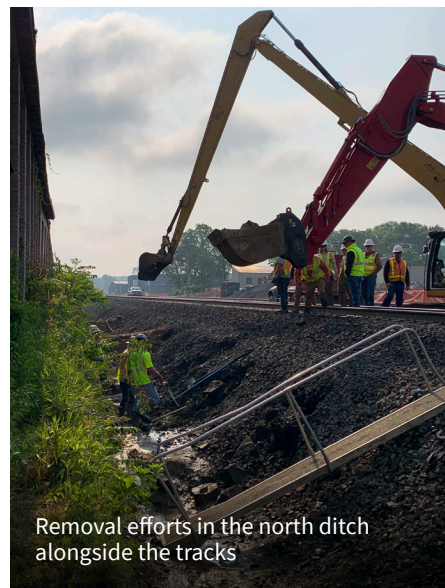
Removal efforts in the north ditch alongside the tracks

that performs independent safety investigations, arrived in East Palestine for a public meeting and two days of investigative hearings. The hearing was a fact-finding step as part of a safety investigation to determine the probable cause of the Norfolk Southern train derailment, hazardous materials release, decision to vent and burn, and to gather more information for recommending safety changes to prevent future derailments and releases. For more information, you can visit the NTSB website: ntsb.gov/news/events/Pages/East-Palestine-Hearing-Event.aspx