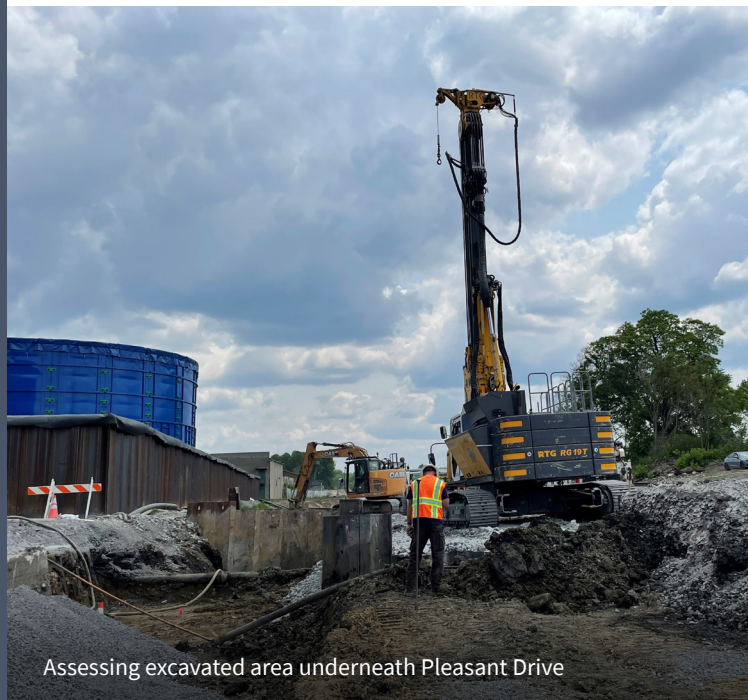
Assessing excavated area underneath Pleasant Drive