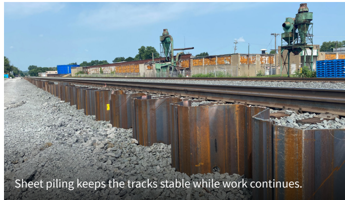
Sheet piling keeps the tracks stable while work continues.