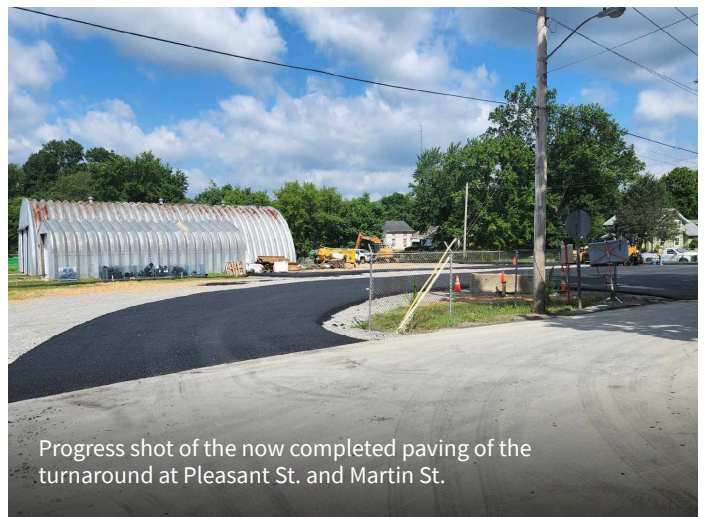
Progress shot of the now completed paving of the turnaround at Pleasant St. and Martin St.

The Way Station and First United Presbyterian Church hosted another information session, with EPA providing a site operations update. EPA gave a presentation about ongoing work including excavating contaminated soil, air monitoring, and cleaning of impacted streams.