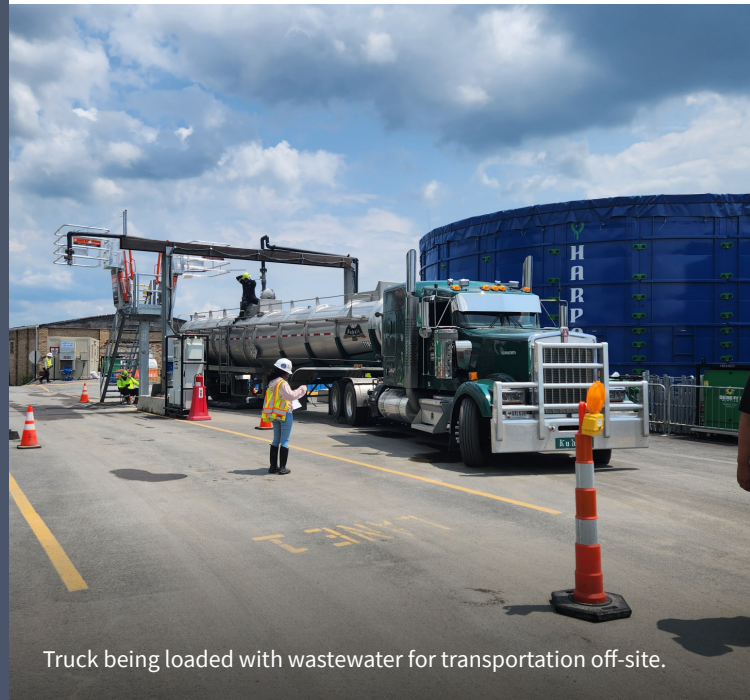
Truck being loaded with wastewater for transportation off-site.