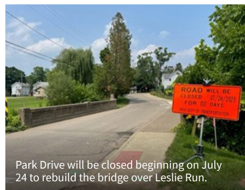
Park Drive will be closed beginning on July 24 to rebuild the bridge over Leslie Run.

The Ohio Department of Transportation (ODOT) will be replacing the Park Drive bridge (originally built in 1940) over Leslie Run, located near the entrance to City Park. Work will include burying a natural gas pipeline. Area residents may notice heavy equipment and road closures. This project is not affiliated with the derailment response, but air monitoring will occur as part of ongoing monitoring initiatives. For inquiries, please contact ODOT at d11.pio@dot.ohio.gov or call 330-308-7817. You can also contact Dominion Energy at OhioConstructionSupport@dominionenergy.com or call 800-362-7557.