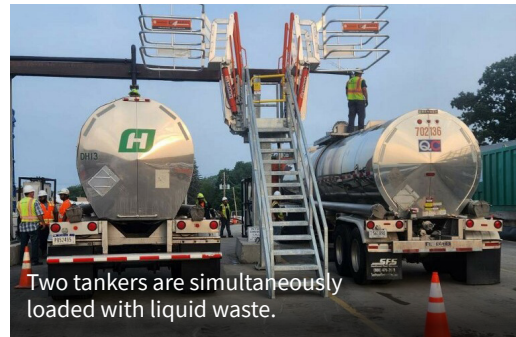
Two tankers are simultaneously loaded with liquid waste.