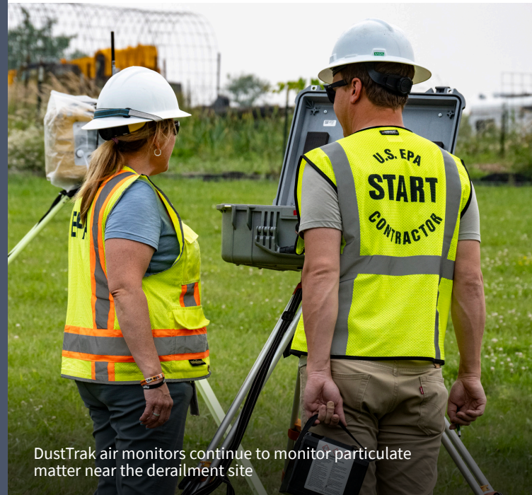
DustTrak air monitors continue to monitor particulate matter near the derailment site