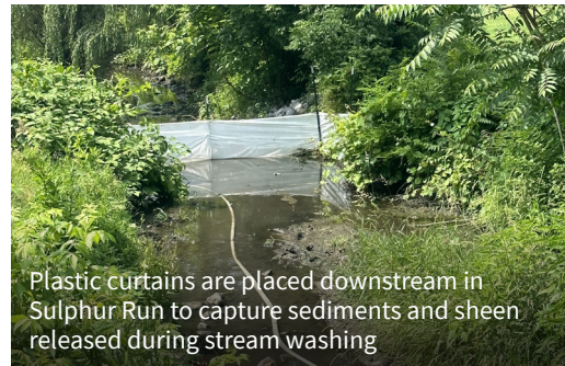
Plastic curtains are placed downstream in Sulphur Run to capture sediments and sheen released during stream washing