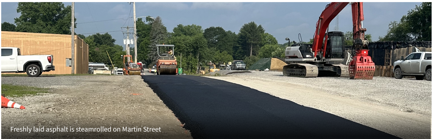
Freshly laid asphalt is steamrolled on Martin Street

A site stormwater inspection was completed on July 8, and additional stormwater controls were put in place to improve the existing stormwater management plan. Going forward, weekly stormwater inspections will determine if and when additional controls are needed.