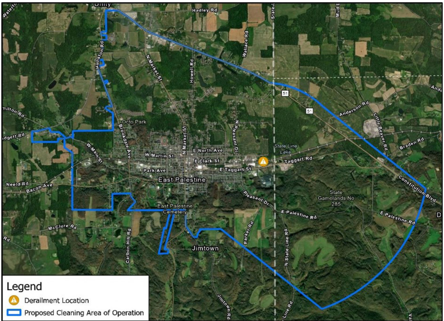
A map of indoor cleaning eligibility boundary. Residents have until September 5 to express interest.