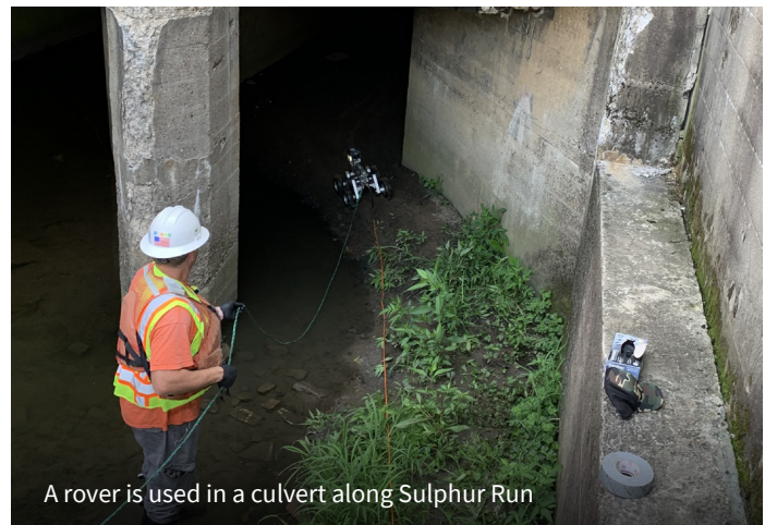
A rover is used in a culvert along Sulphur Run

Cleaning of the small blue storage tanks is ongoing at Tank Farm 5. Solid residues and cleaning water waste are collected during this process for off-site disposal.