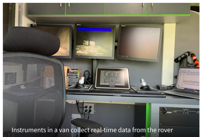
Instruments in a van collect real-time data from the rover