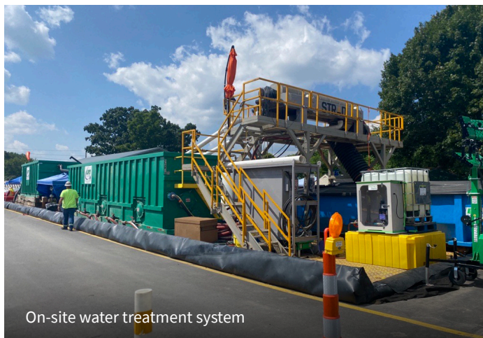
On-site water treatment system