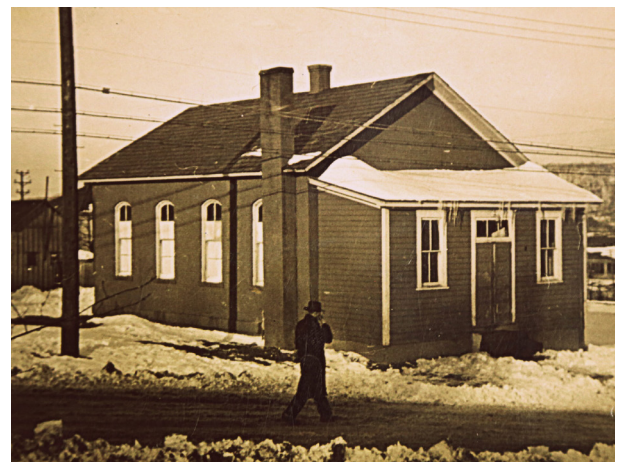
Edwards School circa 1930s

West Mayfield Pennsylvania is celebrating 100 years! In 1816, Mayfield was incorporated into Chippewa, and in 1887 the land was passed to the newly formed White Township. Around this time, the area known as Mayfield was little more than a station on the Pennsylvania Railroad. The station got its name from a farm up on the hill known as Mayfield Cottage. The area west of the station was known as West Mayfield. In 1880, the Edwards School was built. This one-room red brick structure also served as a community meeting house and an auditorium for lectures and other programs. In 1923, West Mayfield split from White Township and incorporated. This year, the West Mayfield Centennial Jubilee will celebrate its history with a parade, music, food, craft vendors, a ball field naming ceremony, activities for kids, and a historical display.