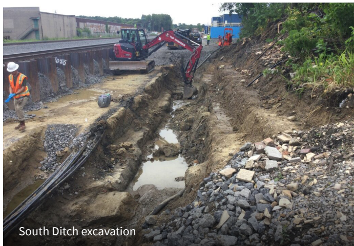
South Ditch excavation

Sediment sampling in Sulphur and Leslie Run has been completed. The results will be used to assess the impact from the derailment on the streams. More cleanup work may be conducted depending on the results of this assessment. Surface water sampling continues.