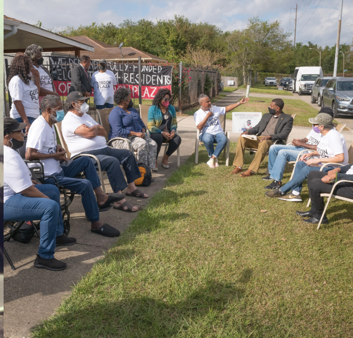
Prioritizing communities with multiple stressors.