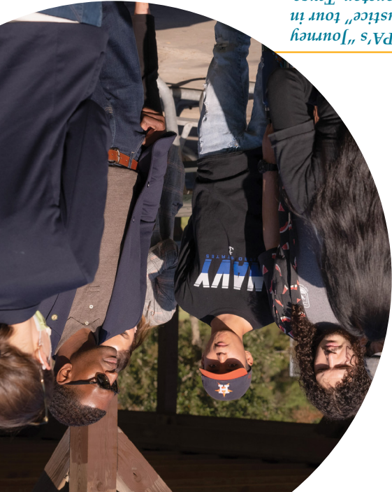
EPA's "Journey to Justice" tour in Houston, Texas.

Eligible entities can request assistance by completing and submitting the CTA Assistance Request Form: www.epa.gov/rcra/forms/ceta-program . Technical support capacity and resources are limited, so the CETA program may not be able to fulfill all assistance requests. EPA will prioritize disadvantaged and historically excluded communities. In cases that are beyond the scope or capacity of CETA, the program will attempt to redirect the request to other appropriate assistance vehicles.