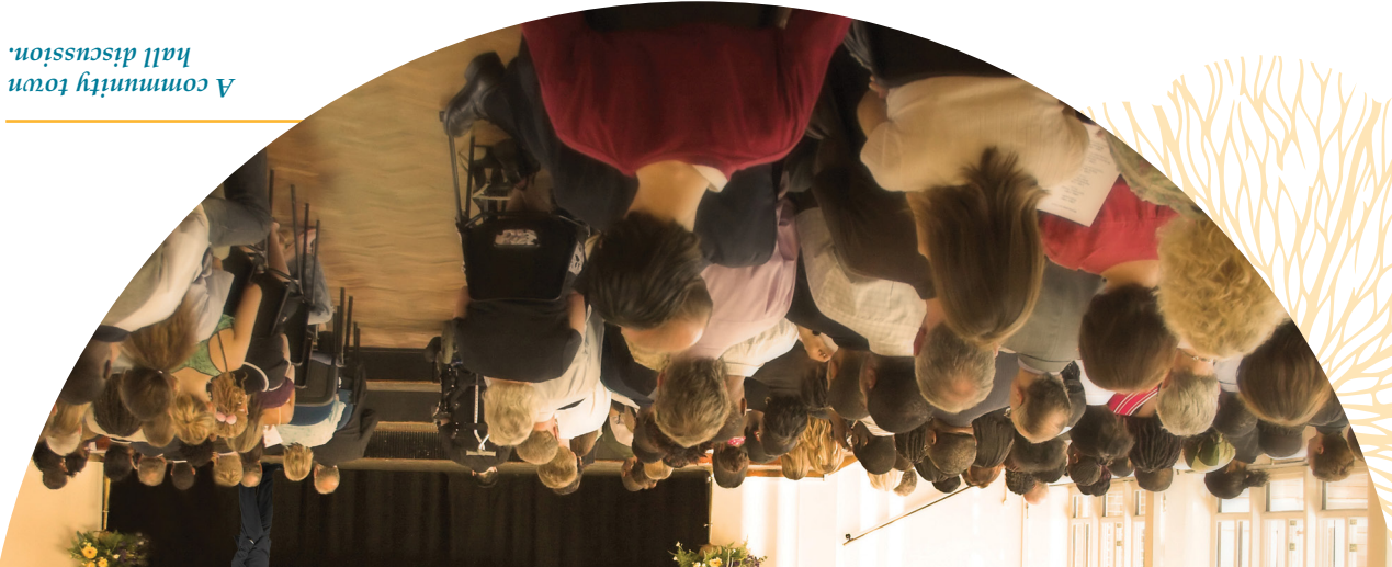
A community town hall discussion.