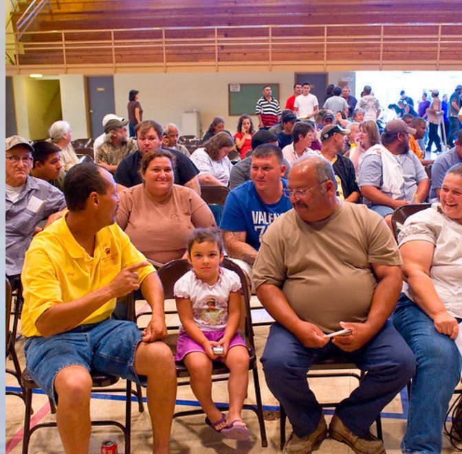
EPA outreach meeting after Hurricane Katrina.

United States Environmental Protection Agency