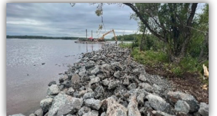
Placement of rock for shoreline protection is ongoing along select sections of shoreline within the project area.