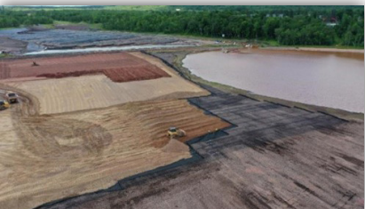
The Delta Upland Cap is being constructed adjacent to the SSB. The cap area will support recreational features designed in coordination with the City of Duluth.