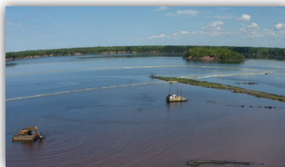
Dredging of impacted sediment from the Shallow Sheltered Bay (SSB) (see map, left) was completed in summer 2022. Photo shows hydraulic and mechanical dredging.