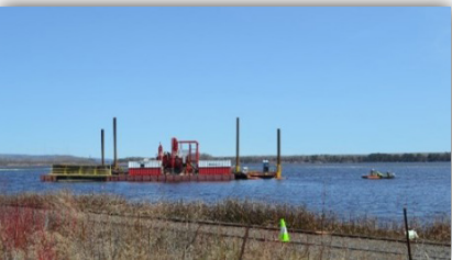
Capping in the Wire Mill offshore and Unnamed Creek offshore areas was completed in June 2022. Capping is ongoing in the SSB over the dredged surface.