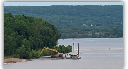
Debris from the SSB shoreline area was removed by mechanical dredging.