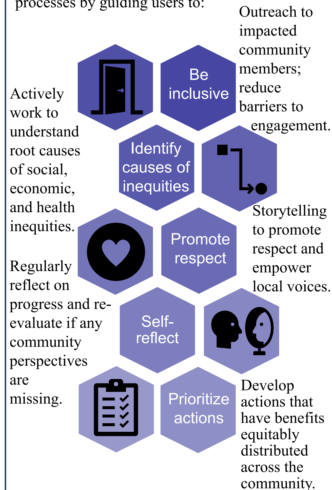
Figure 3. Ways that ERB centers equity.

ERB centers equity in resilience planning processes by guiding users to: