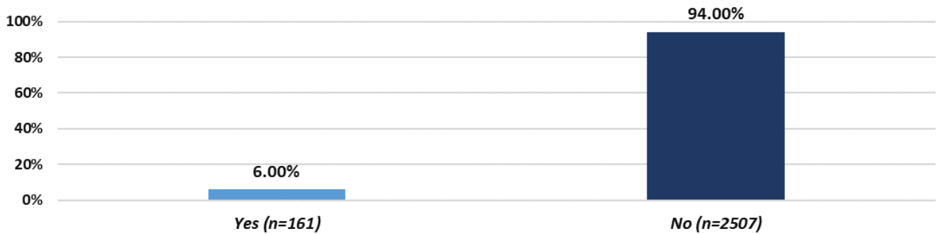
Have you ever reported an allegation related to a potential lapse in scientific integrity? (n=2668)