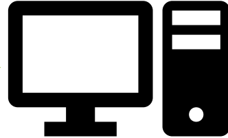
Company hazardous waste software with access to Remote Signer API credentials