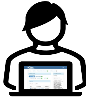
Registered Remote Signer