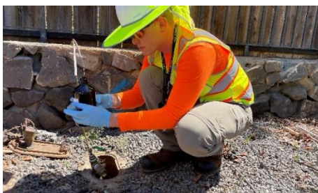
Figure 2: Photo of EPA sampling drinking water in the burned area of Lahaina.

If contamination is detected in a lateral line, it will be isolated from the water system. First, the area will be excavated and cleared to reveal the lateral line. Then the pipe at the connection point to the water main will be cut and then capped, ensuring that contamination does not enter the main distribution line. This work will help restore safe drinking water to Lahaina. EPA will have local cultural monitors and archaeologists observing this work to ensure sensitive or historical areas are not disturbed. Before using your drinking water, be sure to check DWS's Unsafe Water Advisory page mauirecovers.org/water to see if water in your area is safe to drink.