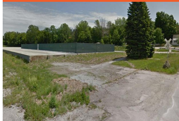
Fonda site after building demolition