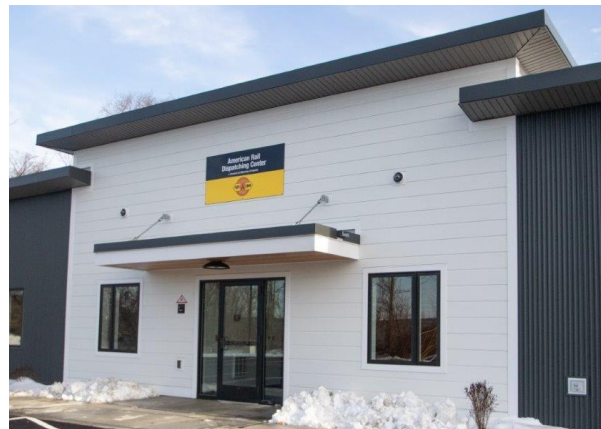
Railway dispatching center

In addition, in 2017 the city tapped into the EPA Brownfields grant program through the Northwest Regional Planning Commission (NRPC) to fully assess the nature and extent of the contamination and prepare for cleanup and redevelopment.