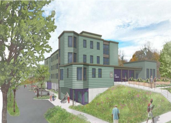
Rendering of proposed senior housing complex

“The redevelopment of the Fonda site is the City’s biggest economic development priority. This has been a long time coming, but the risk of doing nothing with the site far outweighed the time and effort that has gone into tackling this challenge with our funding partners.”