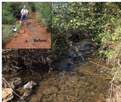
Section 319 funds helped address acid mine drainage (top left) from abandoned mine sites in West Virginia’s Deckers Creek watershed. (For details, read the success story .)

NPS pollution is the dominant source of water quality pollution and the leading cause of impaired waters in the United States. Our nation’s water quality challenges continue to grow with increasing population and changing land use and climate conditions. For more details about NPS pollution, see the EPA’s Polluted Runoff: Nonpoint Source (NPS) Pollution website .