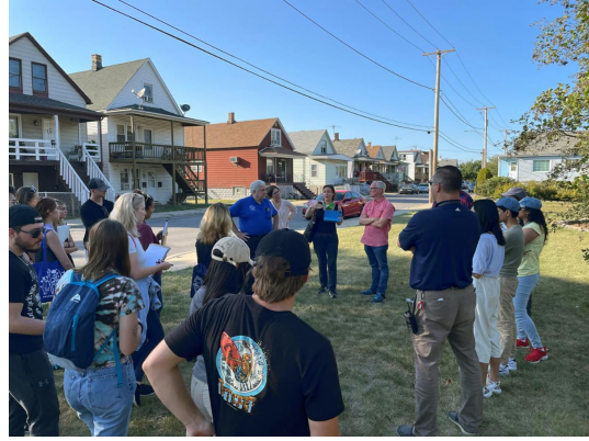
Above: A community event in a Whiting neighborhood during the announcement of a new tree planting project.

Planning Commission (NIRPC), the Student Conservation Association, BP America, USDA Forest Service, Indiana DNR Urban Forestry Program, Northern Indiana Public Service Company, the Wildlife Habitat Council, Urban Waters Federal Partnership, among others. Several of these organizations are core partners in the CommuniTree Program locally administered by NIRPC. Read more here .