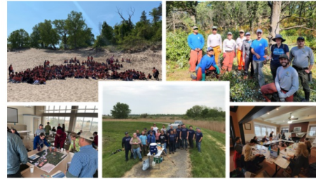
Above: A collage of photos shared by NWI UWFP partners and featured throughout the 2024 NWI UWFP Work Plan.