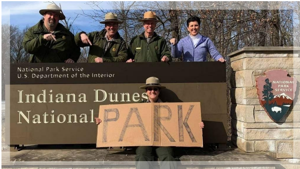
Indiana Dunes National Park Rangers and Indiana Dunes Tourism celebrating the historic name change from a National Landmark to a National park in 2019.