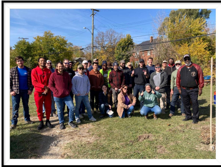
Above: Group photo of WHC partners and volunteers at a community event on a sunny day.