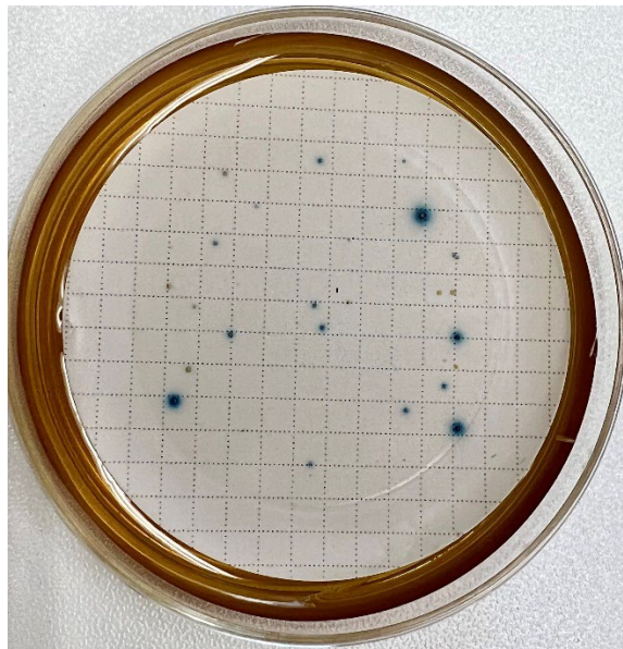
Photo 1. Enterococci colonies on mEI produce blue halos.