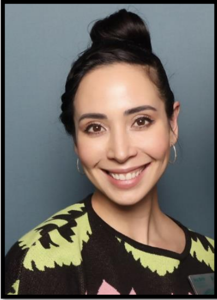
Senior Project Manager Chignik Bay Tribal Council