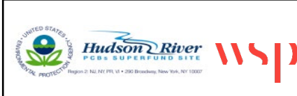
Water Column, Sediment and Fish Tissue Concentrations in the Pre-Dredging and Post-Dredging Periods