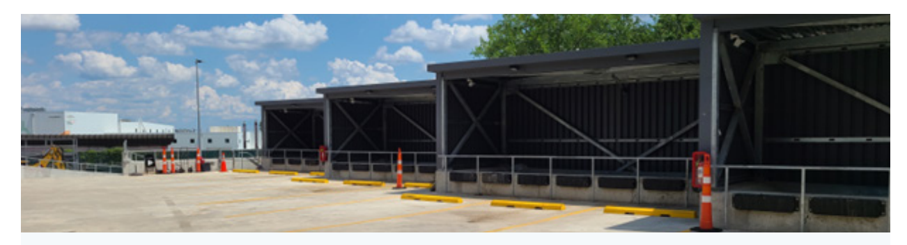
New elevated and covered disposal area at Trash Transfer Station

The project elevated the site's drop-off portion and covered the disposal area to prevent contaminants from entering the storm sewers. In addition, now the rainwater enters a bioretention basin to allow it to slowly percolate into the ground. By implementing this green infrastructure best practice, less rainwater will enter the sewer system for treatment – saving both energy and system capacity. The new roof and ramp cover 28,488 ft² and can treat over 17,000 gallons of stormwater. This construction project will serve the whole population of D.C., which consists of almost 700,000 residents.