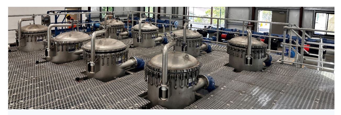
New ASPA sewage system and storage building.

The project, which serves approximately 15,000 residents on the island, cost $8 million and was completed in fall 2023.