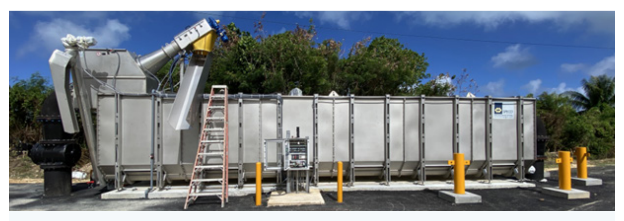
Primary screen at the Sadog Tasi Wastewater Treatment Plant

Functioning as the first line of treatment for Saipan's Northern Sewershed, this critical installation significantly improved the CNMI's ability to maintain compliance with wastewater discharge permit requirements and enhanced the quality of the treated wastewater discharged into the ocean. The project, which cost $1 million, serves over 3,000 residents and was completed in January 2023.