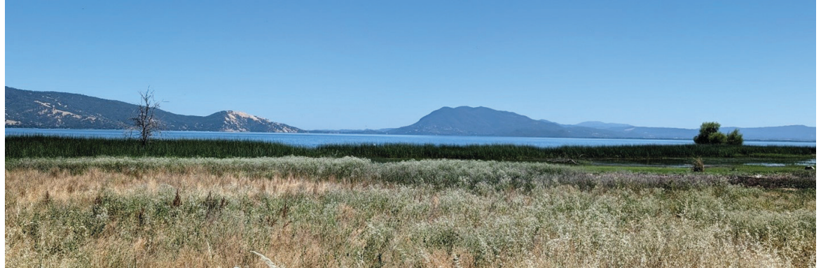
Photo of Clear Lake taken from 3rd Annual Shigom Natural Environmental Day, hosted by Robinson Rancheria Pomo Indians of California.

On June 5, 2024, EPA issued a final memorandum that provides guidance to EPA Regions, states, and territories on when and how to consider potential adverse climate change impacts in the hazardous waste permitting process under the Resource Conservation and Recovery Act. This guidance includes recommendations for conducting climate change vulnerability screenings and assessments for treatment, storage, and disposal facilities to determine whether there are climate vulnerabilities that hazardous waste permits should address. The memo's recommendations ensure that controls provide long-term effectiveness through resilience to adverse climate change impacts into the future.