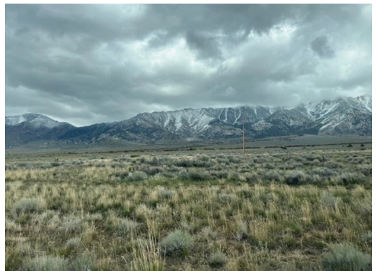
Mountains around the Confederated Tribes of The Goshute Reservation.

EPA OEJECR Grants News and Updates webpage